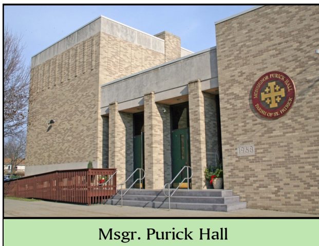
Msgr. Purick Hall

I can be reached at the following telephone number: _____