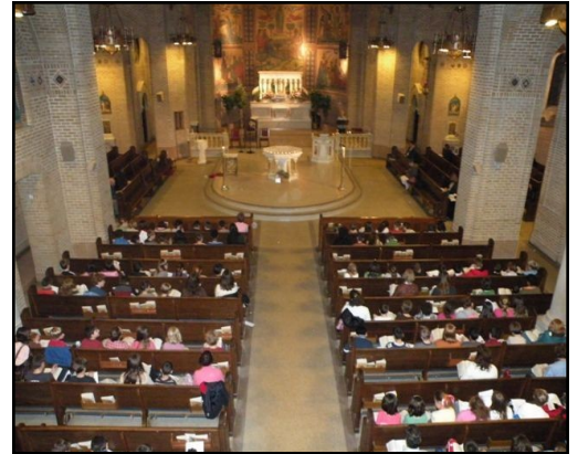
4 th Grade Religious Education Rosary Recitation in the Church

Please complete the following information to register with Saint Patrick Parish and the Religious Education Program. The information you provide is CONFIDENTIAL .