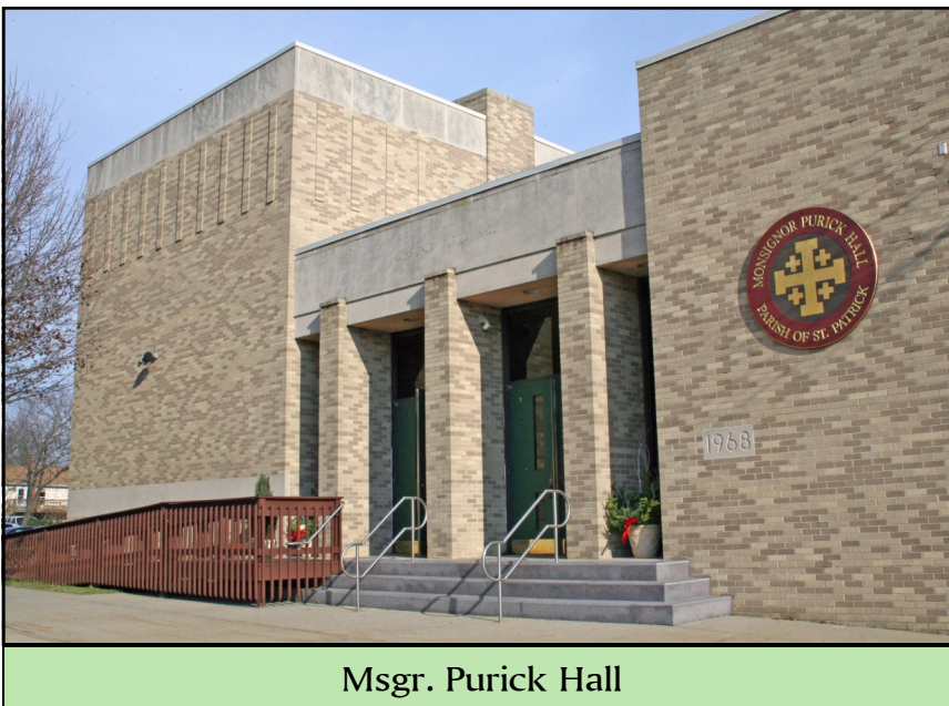
Msgr. Purick Hall

Married Single Divorced Engaged Separated Widow/er Other