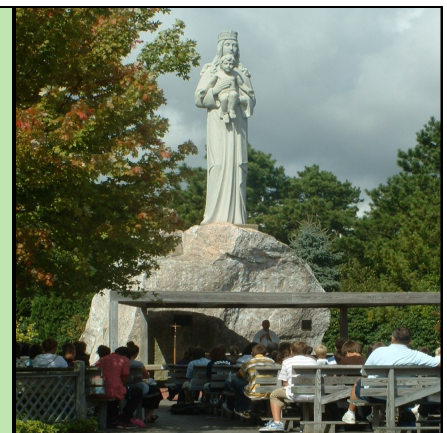
Confirmation Retreat at the Shrine of Our Lady of the Island

St. Patrick Parish is committed to providing religious education and all our services to all our parishioners regardless of their ability to make use of firstFruits . Any family who is unable to enroll in firstFruits for a compelling reason is simply asked to complete the St. Patrick Religious Education Alternative Stewardship Form, provided by the Religious Education Office.